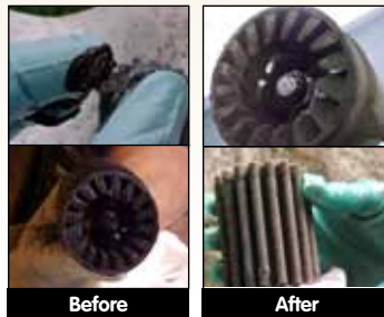
System filter samples showing Untreated fuel versus heating oil treated with HEATDOC. Better, Cleaner & Safer!

With a unique balance of three stabilizers, HEATDOC™ not only keeps today's fuel fresh but also improves the latest blends of ultra-low sulfur and biodiesel keeping your fuel healthy today and into the future. It cleans your heating system by reducing sediment build up that may already be in your tank, pipes, filters, and nozzle. HEATDOC™ also inhibits corrosion and rust in your tank and fuel lines. The result is healthier fuel and heating system that runs more effectively while improving equipment life expectancy. HEATDOC™ is always on call keeping your home heat-healthy!